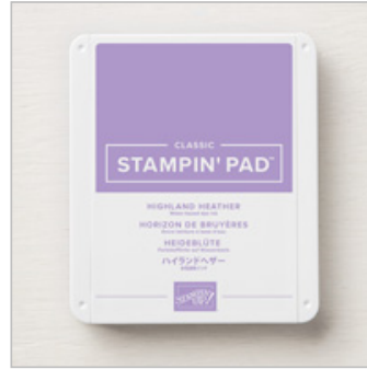
Highland Heather Classic Stampin' Pad