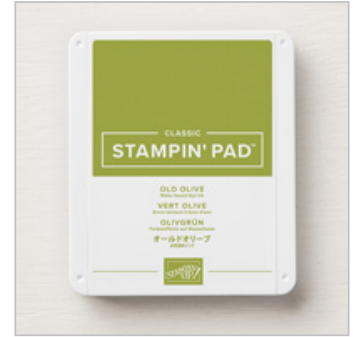
Old Olive Classic Stampin' Pad