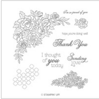
Climbing Roses Cling Stamp Set