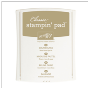
Crumb Cake Classic Stampin' Pad