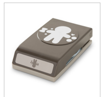
Cookie Cutter Builder Punch