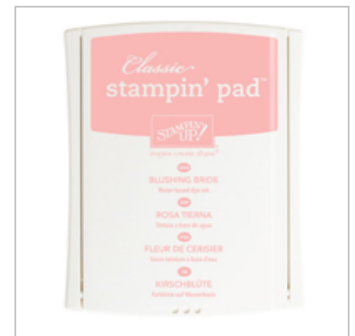
Blushing Bride Classic Stampin' Pad