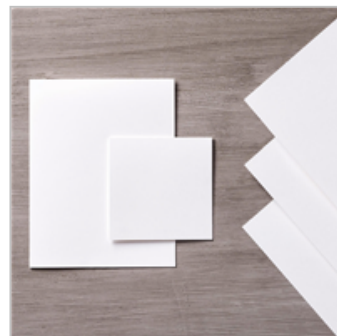
Whisper White 8-1/2" X 11" Thick Cardstock