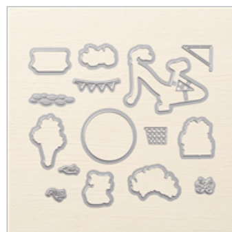
Build A Bike Framelits Dies