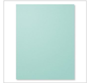
Pool Party 8-1/2" X 11" Cardstock