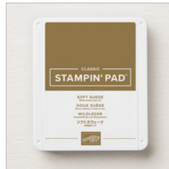
Soft Suede Classic Stampin' Pad