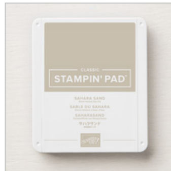
Sahara Sand Classic Stampin' Pad