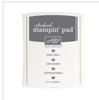
Basic Gray Archival Stampin' Pad