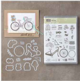
Bike Ride Photopolymer Bundle

9. Ink the sentiment in Basic Gray and stamp onto the 1-1/4" x 1/2" Whisper White cardstock. Cut a "V" in one end. Adhere to the heart in the basket. Accent with a Silver and Pool Party Baker's Twine bow.