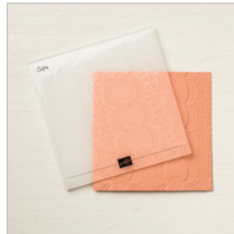
Lace Dynamic Textured Impressions Embossing Folder