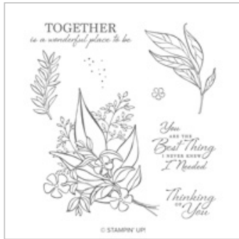
Wonderful Romance Cling Stamp Set