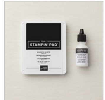
Uninked Stampin' Craft Pad & Whisper White Refill