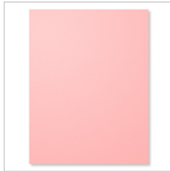
Blushing Bride 8-1/2" X 11" Cardstock