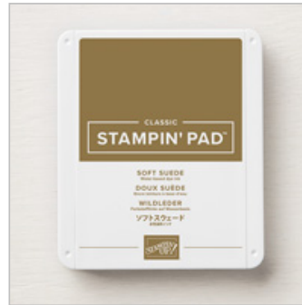
Soft Suede Classic Stampin' Pad