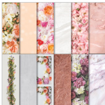
Petal Promenade Designer Series Paper