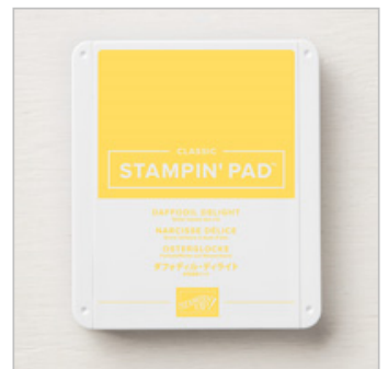
Daffodil Delight Classic Stampin' Pad