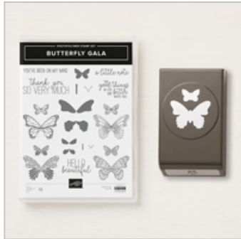
Butterfly Gala Photopolymer Bundle

8. Accent the flowers using So Saffron Share What You Love Artisan Pearls. Accent the butterflies with Petal Pink pearls.