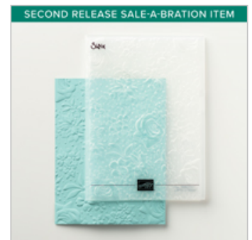
Country Floral Dynamic Textured Impressions Embossing Folder