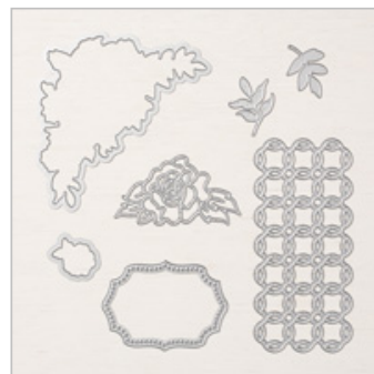
Rose Trellis Thinlits Dies