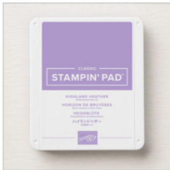
Highland Heather Classic Stampin' Pad