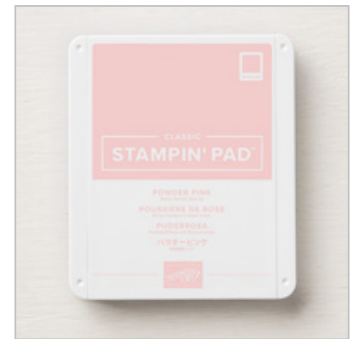
Powder Pink Classic Stampin' Pad