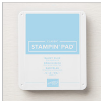
Balmy Blue Classic Stampin' Pad