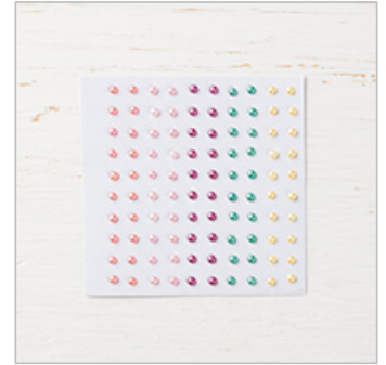
Share What You Love Artisan Pearls