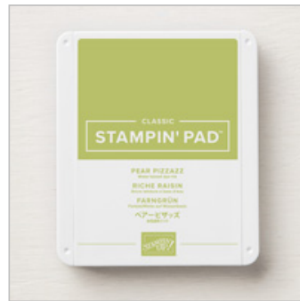
Pear Pizzazz Classic Stampin' Pad