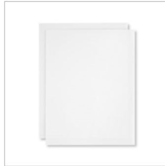
Vellum 8-1/2" X 11" Cardstock