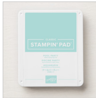
Pool Party Classic Stampin' Pad