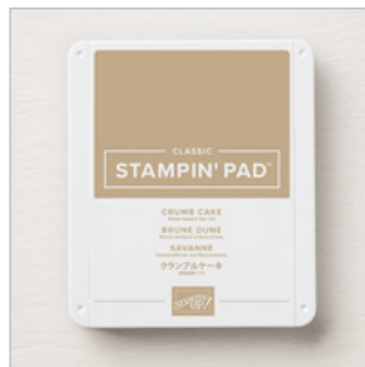
Crumb Cake Classic Stampin' Pad