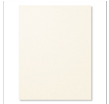
Very Vanilla 8-1/2" X 11" Cardstock