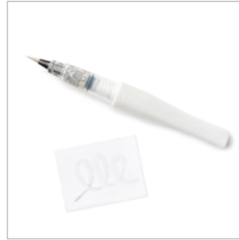
Clear Wink Of Stella Glitter Brush