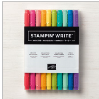
Brights Stampin' Write