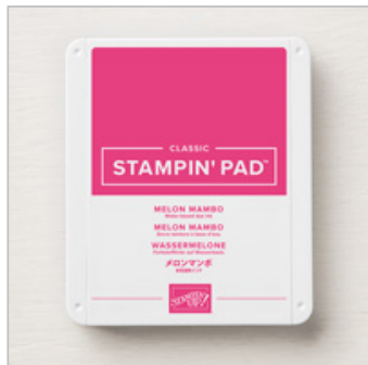
Melon Mambo Classic