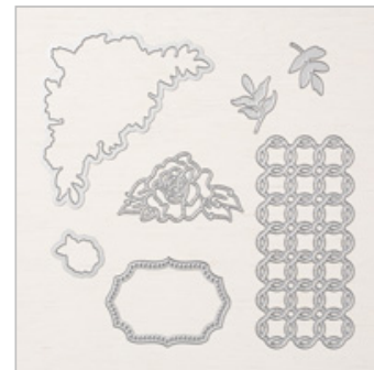
Rose Trellis Thinlits