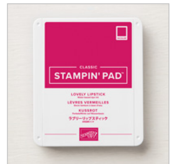
Lovely Lipstick Classic Stampin' Pad