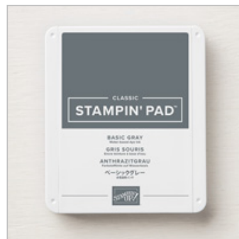
Basic Gray Classic Stampin' Pad