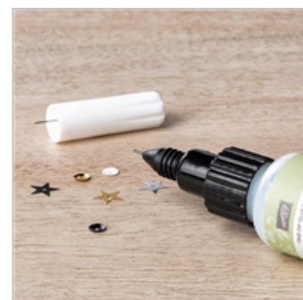
Fine-Tip Glue Pen