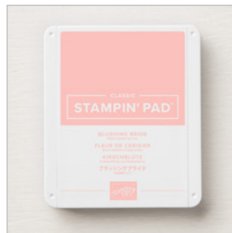
Blushing Bride Classic Stampin' Pad