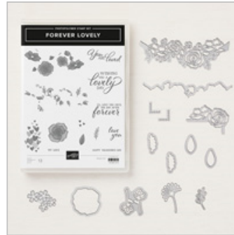
Forever Lovely Photopolymer Bundle