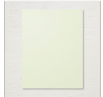
Soft Sea Foam 8-1/2" X 11" Cardstock