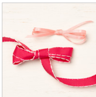
All My Love Ribbon Combo Pack