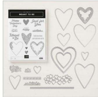
Meant to Be Cling Bundle