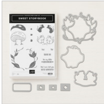
Sweet Storybook Photopolymer Bundle

8. Ink the heart from Meant to Be with Lovely Lipstick. Snip out. Position between the two mice, and adhere with a dimensional. Accent with three clear rhinestones.