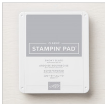
Smoky Slate Classic Stampin' Pad