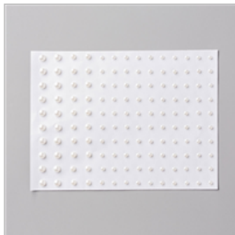
Pearl Basic Jewels