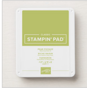
Pear Pizzazz Classic Stampin' Pad