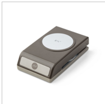
2-1/4" (5.7 Cm) Circle