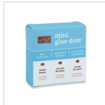
Mini Glue Dots