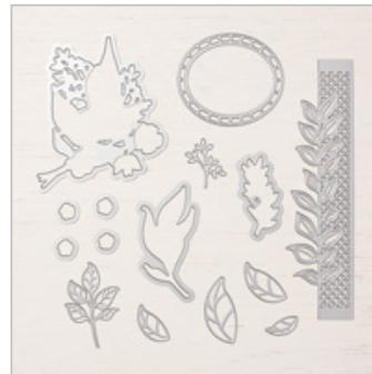
Wonderful Floral Framelits Dies