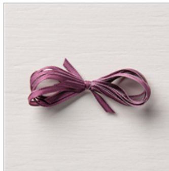
Fresh Fig 1/8" Sheer