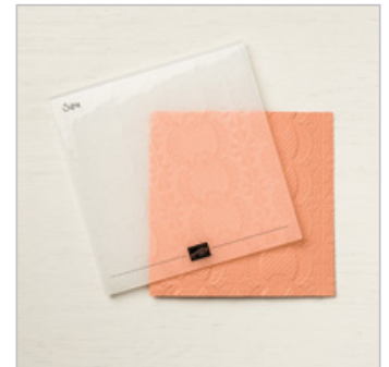
Lace Dynamic Textured Impressions Embossing Folder