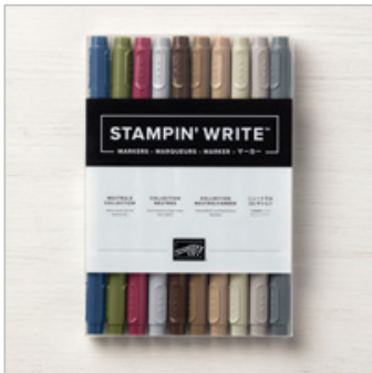
Neutrals Stampin' Write Markers