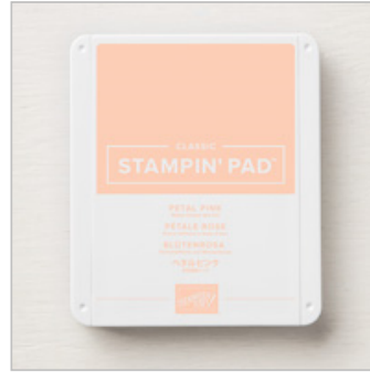
Petal Pink Classic Stampin' Pad