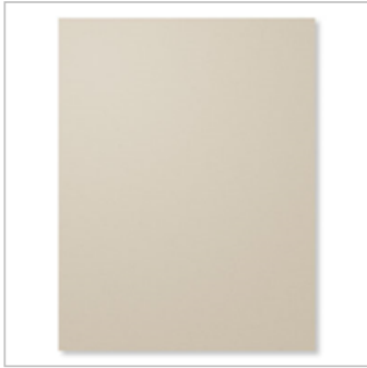
Sahara Sand 8-1/2" X 11" Cardstock