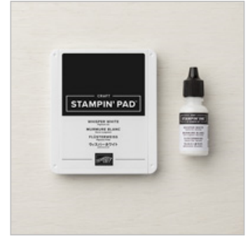
Uninked Stampin' Craft Pad & Whisper White Refill