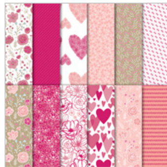
All My Love 12" X 12" (30.5 X 30.5 Cm) Designer Series Paper