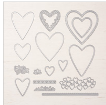
Be Mine Stitched Framelits Dies