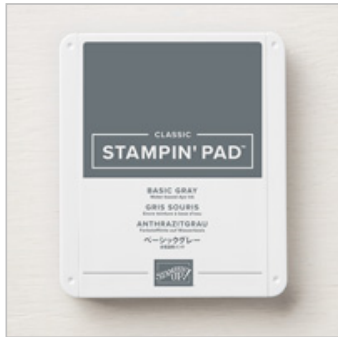
Basic Gray Classic Stampin' Pad