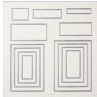
Rectangle Stitched Framelits Dies