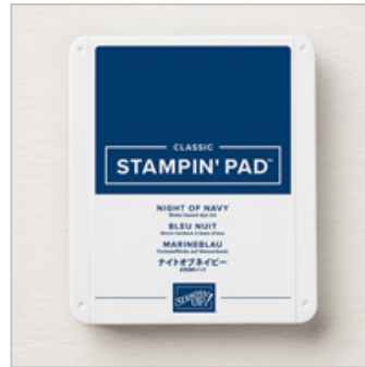
Night Of Navy Classic Stampin' Pad