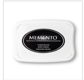
Tuxedo Black Memento Ink Pad