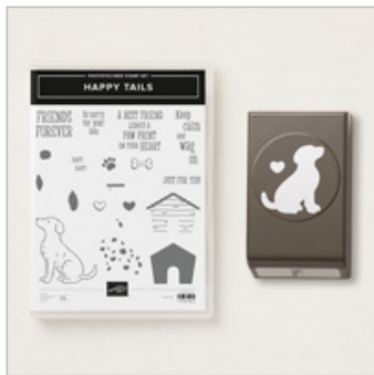
Happy Tails Photopolymer Bundle

8. Ink the collar in Night of Navy, and stamp it onto the dog's neck. Add a clear rhinestone "dangle" as shown. Stamp the heart in Lovely Lipstick, and add below the dangle. (You can either use the heart from Step 7 or stamp on a scrap and punch.)