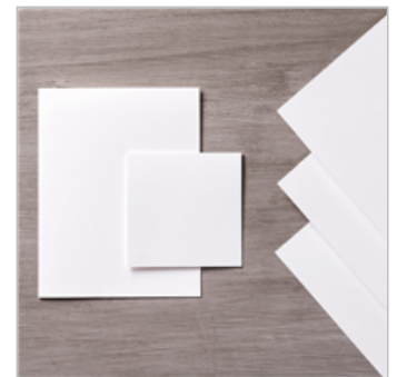
Whisper White 8-1/2" X 11" Thick Cardstock