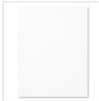
Whisper White 8-1/2" X 11" Cardstock