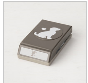
Dog Builder Punch