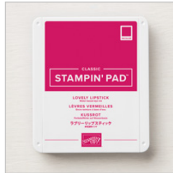
Lovely Lipstick Classic Stampin' Pad